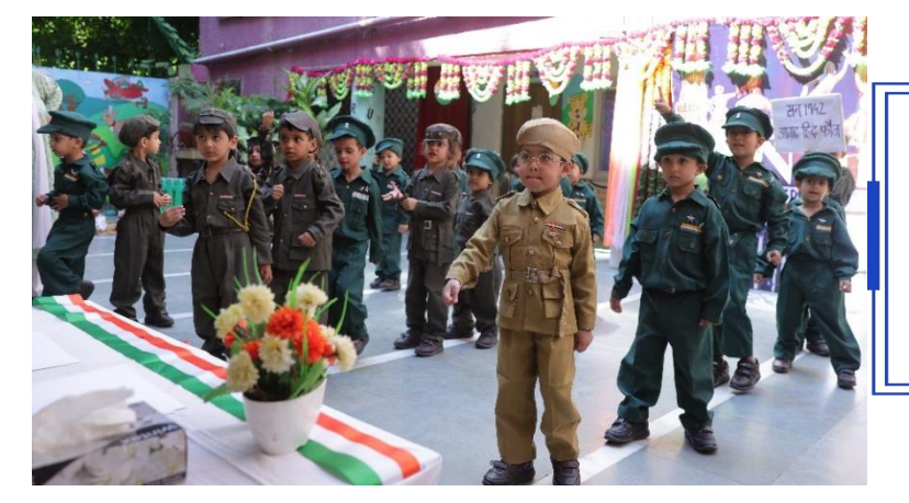
Tiny tots of Nursery and Pre- Primary marked several occasions with their enthralling performances on Gandhi Jayanti, Independence Day, Diwali, Earth Day, Energy Conservation Day.