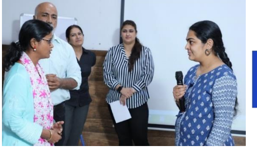
Aiming to provide an intense training on "Learning Outcomes and Pedagogy", we hosted a CBSE workshop that focused on development of "SMART" learning outcomes in order to achieve competency based education where students are trained to become lifelong learners equipped with knowledge, abilities and required skills.